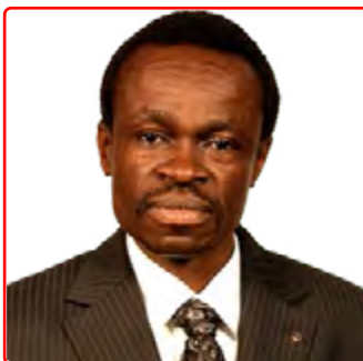
Prof. PLO Lumumba Kenya

Experienced professional with a demonstrated history of working in the non-profit organization management industry. Skilled in Negotiation, Cash Flow, Enterprise Risk Management, Business Planning, and Internal Audit. Strong business development professional graduated from Zambia Centre for Accountancy Studies -ZCAS, Evelyn Hone College for Applied Arts and Commerce, Zambia and the Emile Woolf School of Accountancy, UK